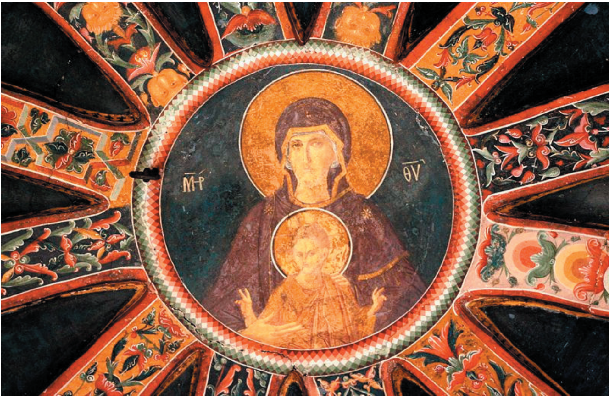
Virgin and Child in Dome of the Paraclesion in Chora Church, Istanbul.